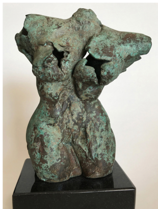
Nero VI , 1999, bronzo anticato, h 21x16x19 cm