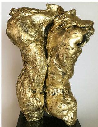
Nero IX , 1999, bronzo e foglia d'oro 22 k, h 32,4x23x15,2 cm