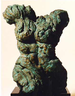
Nero XII , 1999, bronzo anticato, h 31x23x17 cm