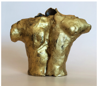
Nero III , 1999, bronzo e foglia d'oro 22 k, 18x23x11 cm