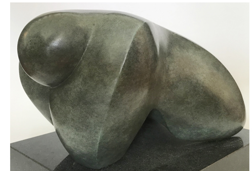
Leaning Figure 1999, bronzo, h 20x29,5x18,5 cm