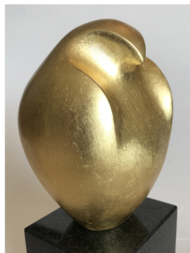
Gufo , 2018, bronzo con foglia d'oro 22k, h 11x8x8,2 cm