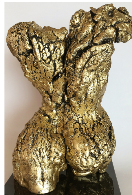
Nero XII, 1999, bronzo con foglia d'oro 22 k, h 31x23x17 cm

Invito al brindisi con l'artista Sabato 7 Dicembre ore 18,30