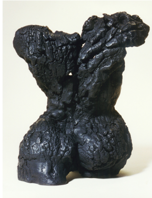
Nero XII , 1999, bronzo, h 31x23x17 cm