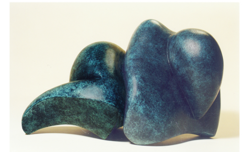
Reclining Woman , 1999, bronzo, h 25x43x25 cm