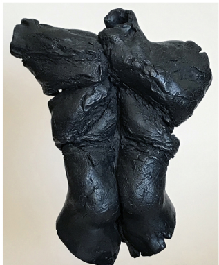
Nero XV , 1999, bronzo, h 28x21x9 cm