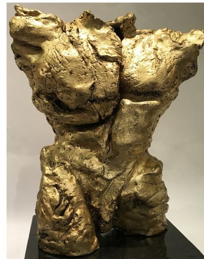
Nero XIII , 1999, bronzo e foglia d'oro 22k, h 28x21x12cm