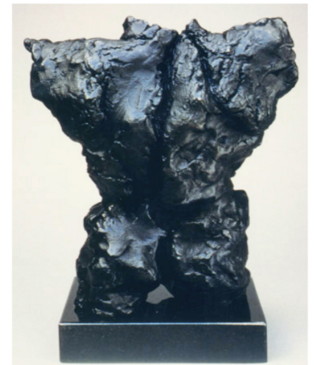
Nero XIII , 1999, bronzo, h 28x21x12 cm