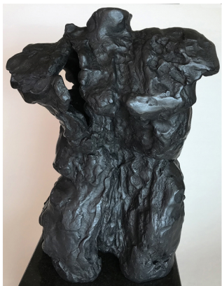
Nero IX , 1999, bronzo, h 32,4x23x15,2 cm